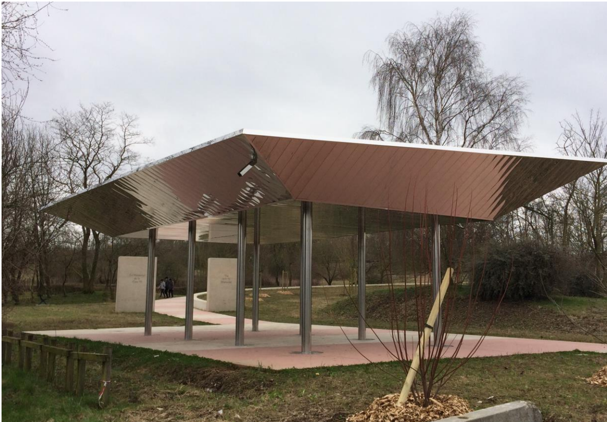
The newly constructed Visitors Kiosk near the front gates of the Hill 70 Memorial.

The stainless-steel cladding has now been applied to the roof of the visitors Kiosk, and the information panels are manufactured and waiting to be shipped any day now to be mounted inside.