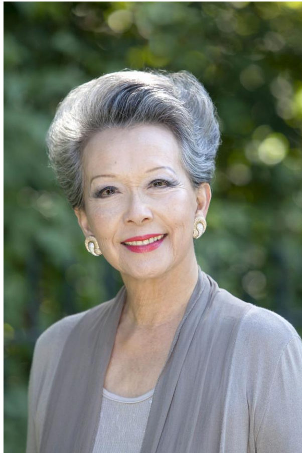
The Honourable Dr. Vivienne Poy has been not only a generous donor but extremely helpful in providing advice and guidance to assist the Project to accomplish its many aims.