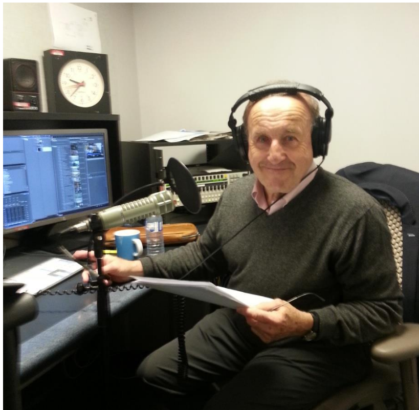
M. Bernard Derome recording the French narrations for the Hill 70 audio Tour