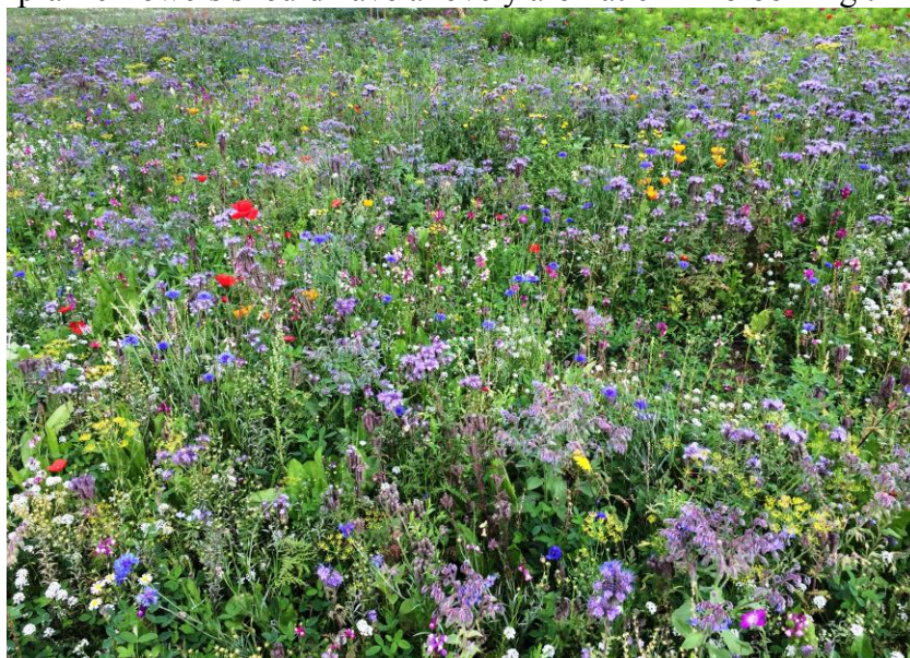
New Prairie Grass featuring the natural flowers of Northern France

The landscaping is doing well, and in fact the combination of a wet spring and a hot summer has caused the prairie grass to grow much taller than the landscapers expected. We are now planning to mow one meter alongside all the paths and around the benches in order to keep nature at bay, though the blend of prairie flowers should have a lovely aromatic mix blooming through three seasons.