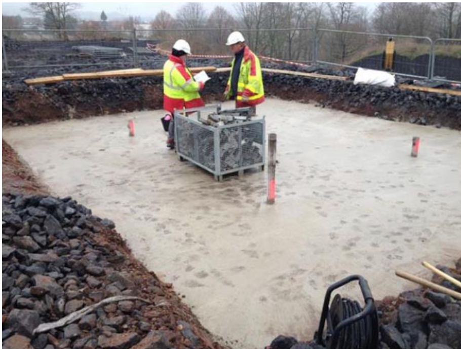
Pictured above is the site of the Obelisk with its piles sunk through a concrete footing! It is finally happening!!