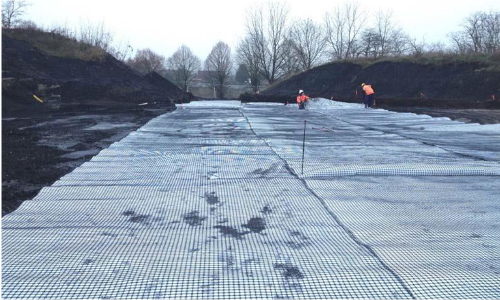
This photo shows the sub-floor of the amphitheatre with its underlay being installed in mid December.

We only have enough funds to do the parking lot, washrooms, main entry walk, amphitheatre and of course the Obelisk. But fundraising continues apace. Every new penny we raise now will go towards another planned component. There are requirements for more walkways, more benches, the information Kiosk, etc. Though the Government may be considering a contribution, all the funds we have raised to date are from private citizens, so we continue to hope for their support.