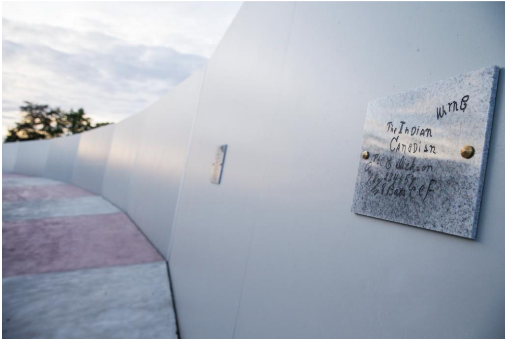
The trench is lined with inscriptions written by young Canadian soldiers on 1917 on the tunnel walls beneath no-man's-land. For many soldiers it was the last thing they ever wrote.