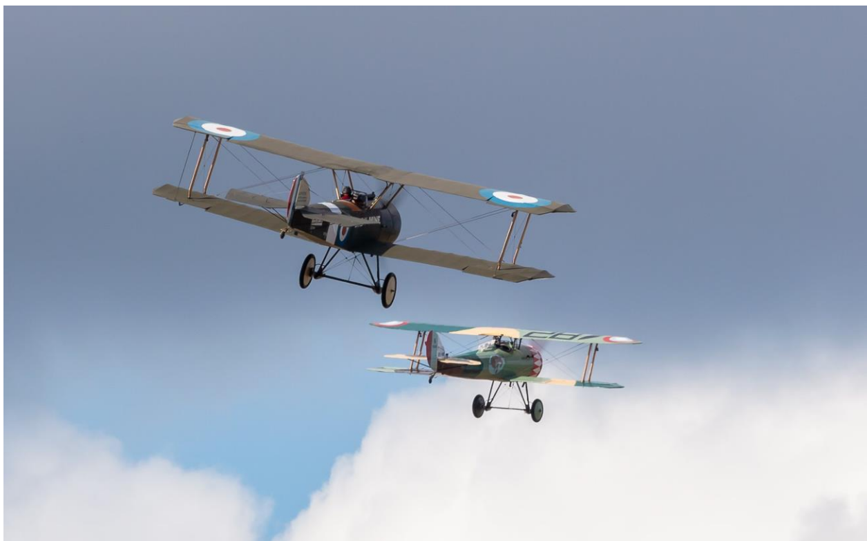
Here are Sopwith Pup and a Nieuport heading toward the Hill 70 Memorial