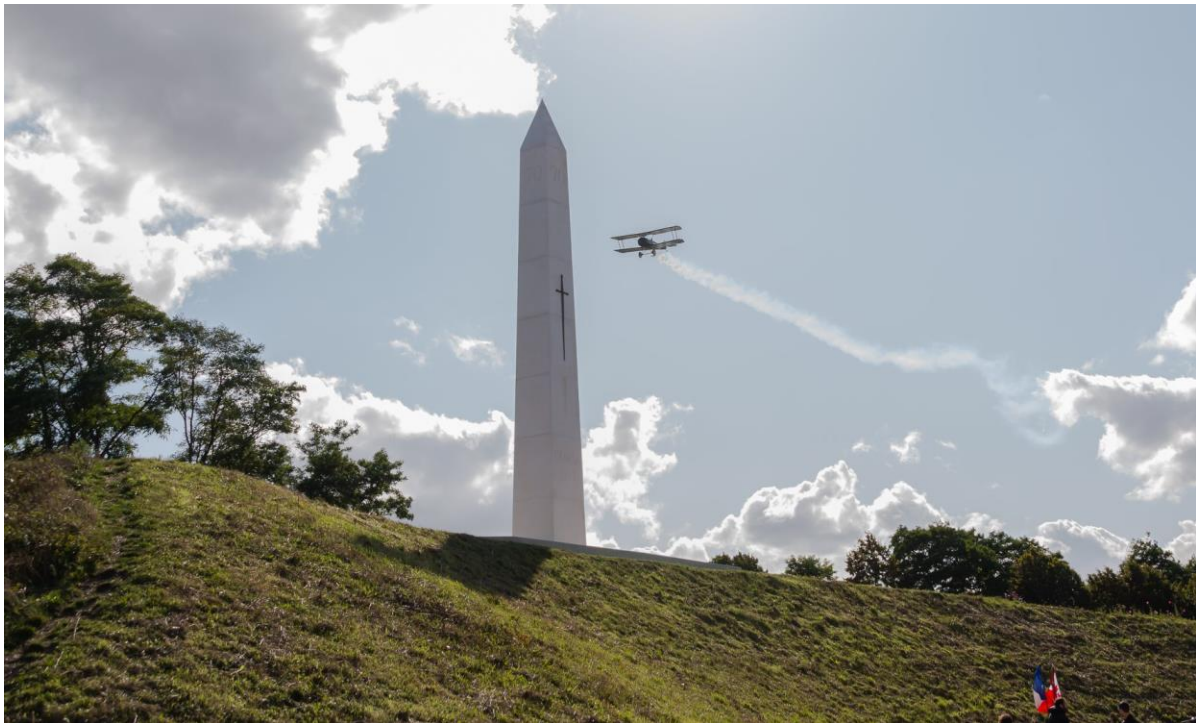
There was a flyover of vintage first war aircraft which were painted in the colours of one of the Canadian Squadrons of the Royal Flying Corps which fought over the Battle of Hill 70.