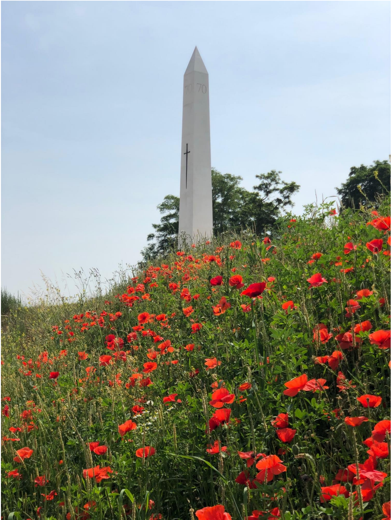
New Prairie Grass featuring the natural flowers of Northern France has been the planted throughout the Memorial site